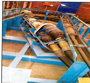
Figure 2: Branching units