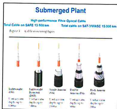
Figure 1: Optical Fibre Cable